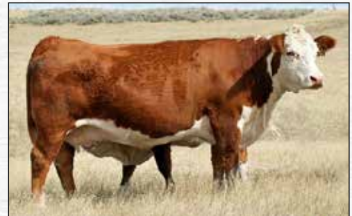
- MATERNAL GRAND DAM 73S -