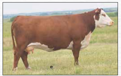
- PATERNAL GRAND DAM 719Z-

Truman 18G has the sogginess, depth of side and volume that I love to see in a beef bull. He is nicely balanced and correct in his stature, putting it all together with loads of dimension and muscle. If that's not enough, he boasts a great balanced set of numbers. His Hometown dam is an up and coming star that has consistently raised a calf in the top end. - Top 10% WW, 15% WW, 20% TM, SC, and 25% REA, Indexes 103 on WW and 102 on YW. - Homo Polled - 2019 MHA Field Day Reserve Champion Bull