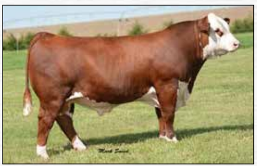
- PATERNAL GRAND SIRE 6964 -