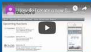
Create An Account