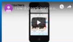
How It Works