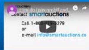
Payment & Delivery