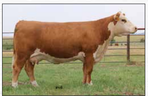
GRAND DAM :: CVIH 19Z