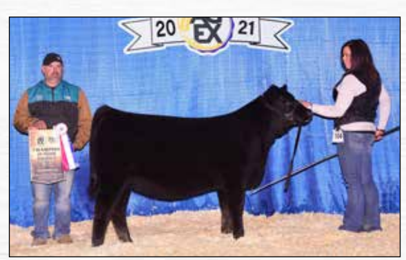
DAM OF 73J IS MATERNAL SIB TO LOT 27 CAP 73J