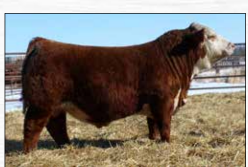
MATERNAL SIB :: RSK 30H