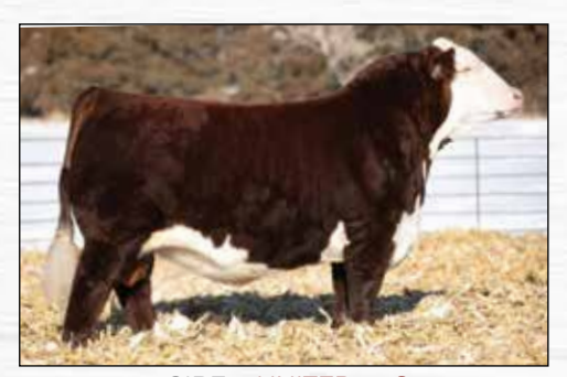
SIRE:: UNITED 36G

RANKS IN THE TOP 5% FOR WW AND YW, 10% SC AND MARB