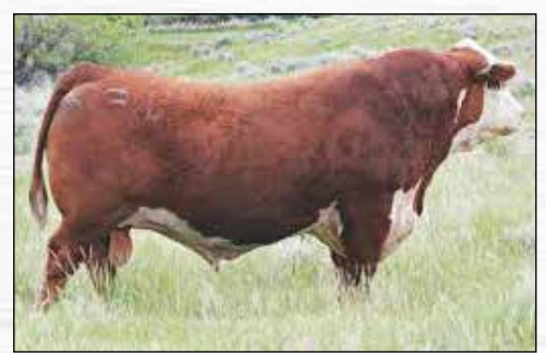
SIRE:: HOMEGROWN 8Y

RANKS IN THE TOP 5% MM, TM AND REA, 15% YW SC AND 20% WW INDEXING 109 ON WW