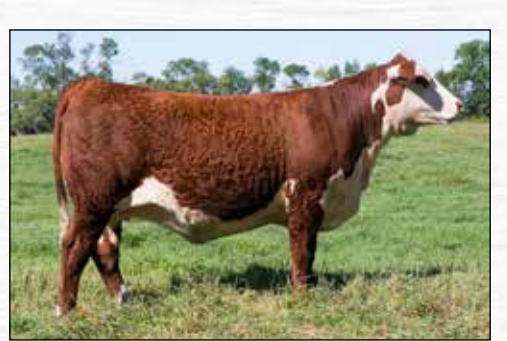
DAM :: RSK 98G