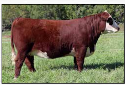
DAM:: RSK 60F