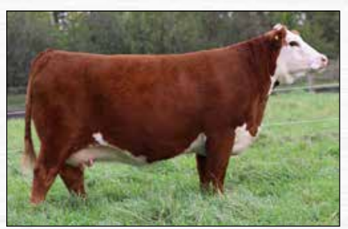
DAM :: BC 20E