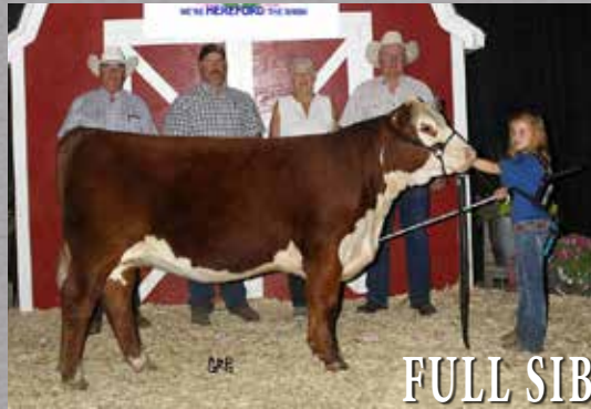
FULL SIB RSK 173D MISS RIESLING ET 82H