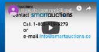
Payment & Delivery