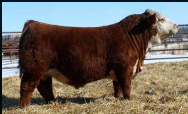
RSK SCK 7165 DOUBLE DOWN 30H