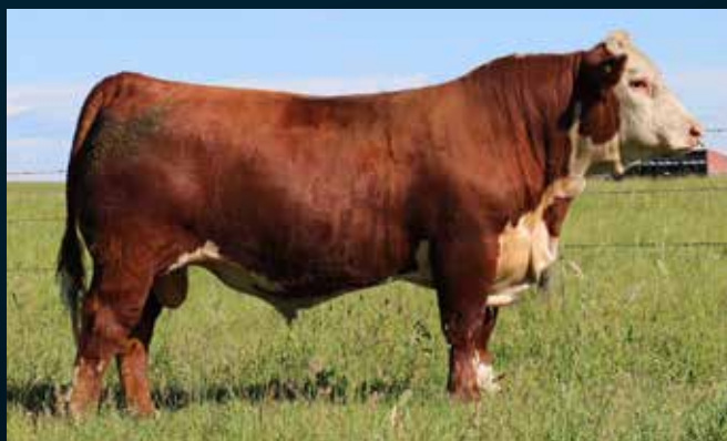
H RW ALL IN 7165 ET