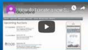
Create An Account