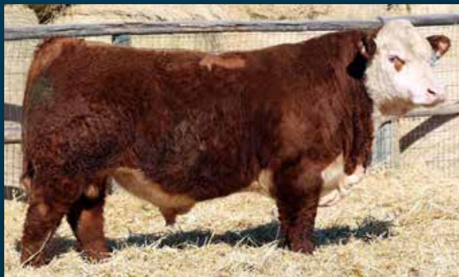
NJW 139C 181F BALANCE 207H

SERVICE SIRE TO LOTS 8,10,14 & SEMEN LOTS 27-36