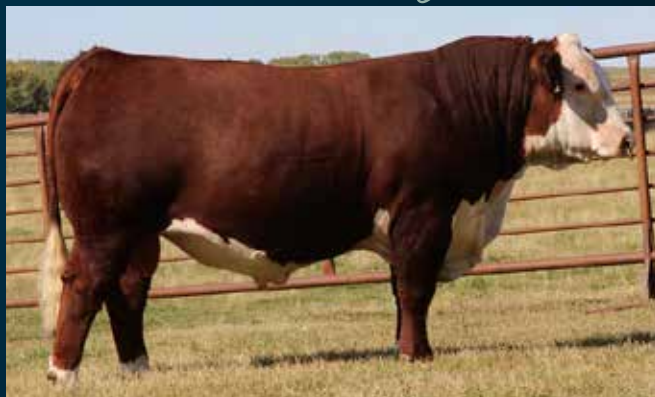
KJ B/ 719Z TRUMAN 695D ET

SERVICE SIRE TO LOTS 8,10,14 & SEMEN LOTS 27-36