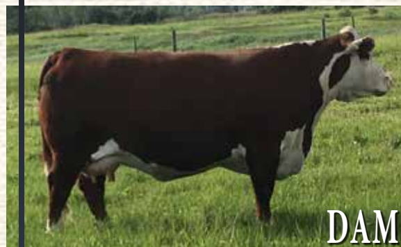
DAM RVP 51X ABLAZE 7A

Miss Ablaze 86J is a head turner, she will make you keep coming back to her. Take your time and study this girl. She has the look, extension and shape and puts it all together in a well balanced appealing package. She is one that will be competitive in the ring and a producer in your herd. Miss Ablaze is sired by none other than United 36G, who was 2020 CWA National Champion Bull, President Cup Champion and Top 10 finalist. United 36G then went on to sell for $215,000 later that fall and then was supreme champion at the inaugural OKC show in the US. Her dam needs no introduction, being undefeated in 2016 as CWA National Champion, as well as Farm Fair, Olds Fall Classic and Bonanza Champion female. She then went on to win herefordbreeder.net North American and World Champion Female. Miss Ablaze 86J is royally bred and will mature into a dominant front pasture donor female that will change the direction of any program.