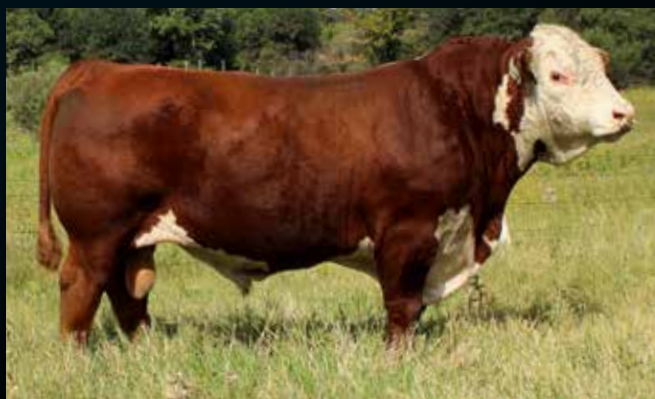
RSK E 2046 DIGBY ET 20C