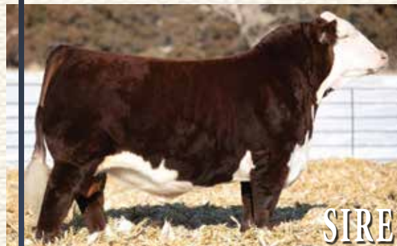
SIRE HAROLDSON'S UNITED 33D 36G