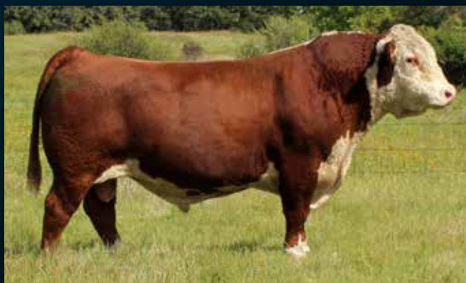
HARVIE AD HARLEN ET 199B