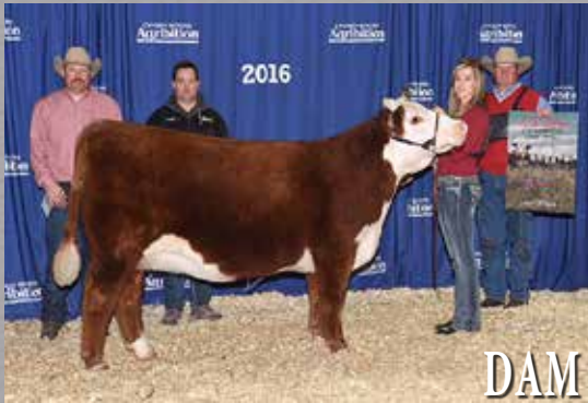
DAM NEXT GEN RIESLING 295 ET