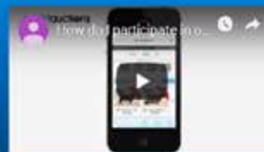
How It Works