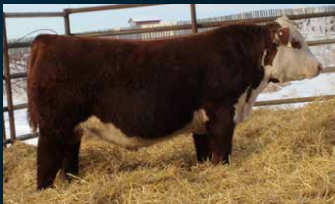
RSK 173D COMMAND ET 91H

SERVICE SIRE TO LOTS 1,2,7,8,9,11,12,13,15,16,17,18,19,20,21