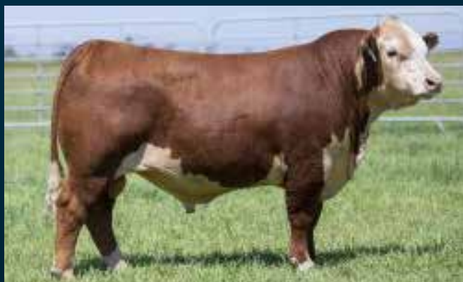
NJW 202C 81E STEWARD 98G ET

SIRE TO LOTS 6,7,9,10,11,12,13,14,15,16 & SEMEN LOTS 43-44