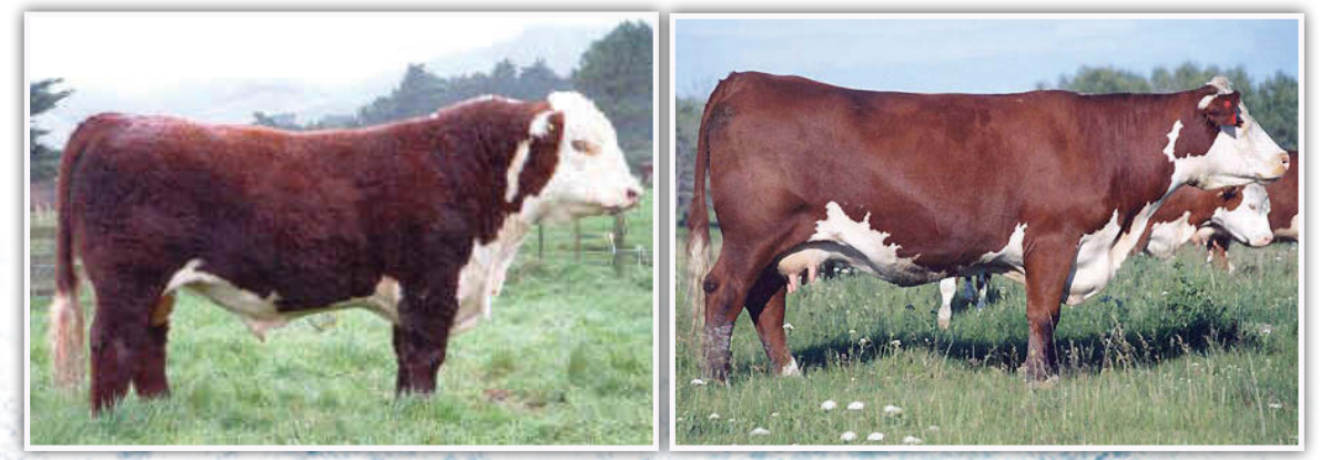
OTAPAWA SKYMATE 2046 - SIRE

Selling 50 doses of US and Canadian qualified semen, in packages of 10 doses. Owned with: Elkhe Herefords, Townsend, MT, USA