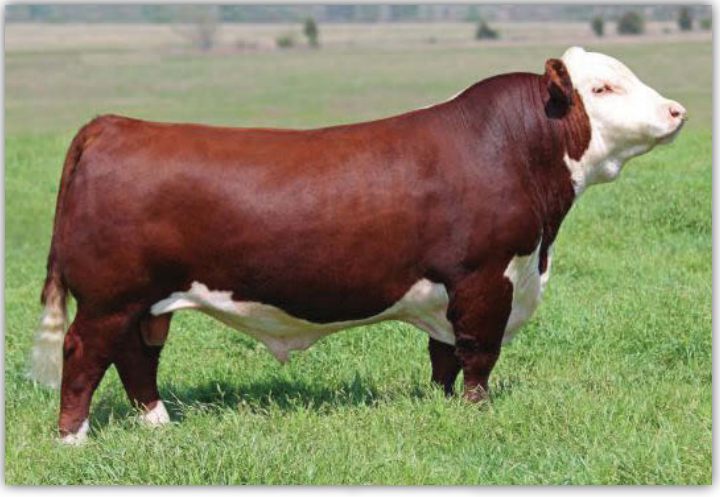
KCL WPF THE PROFESSOR 7110ET - SIRE OF 9B