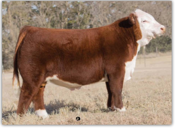
KJ BJ 719Z TRUMAN 659D ET