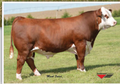
R LEADER 9646 - SIRE