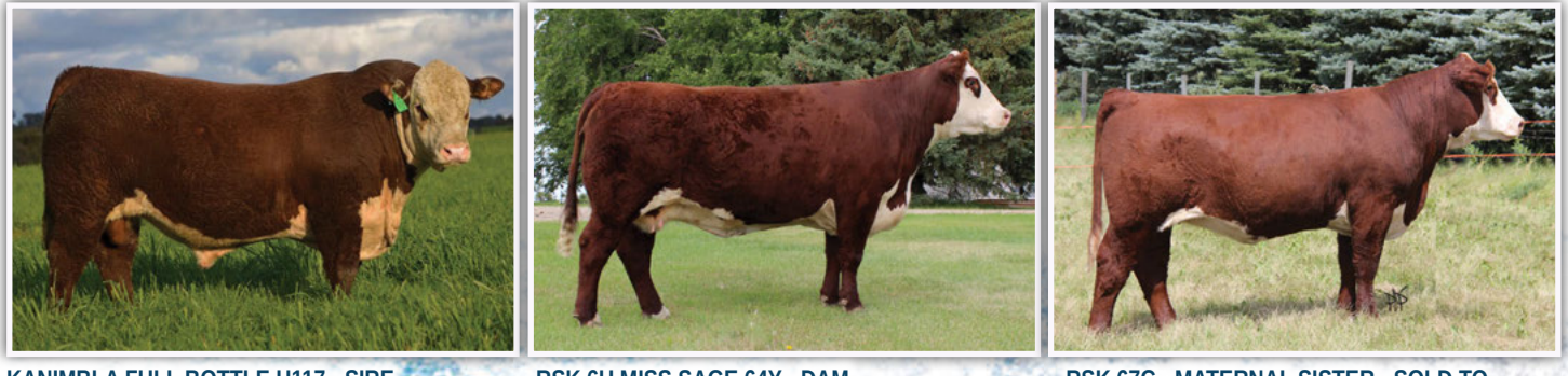
RSK 67C - MATERNAL SISTER - SOLD TO LIAN MOR POLLED HEREFORDS IN 2016 SALE

• A sale feature with powerful donor potential is exactly what this heifer calf is all about. When we had the opportunity to flush RSK Miss Sage 64Y to Full Bottle there was not a doubt in my mind about how good they would be. Full Bottle adds a new outcross to the great Sage cow family and complements Miss Sage 64Y very well. Full of body and power, great shape and strong structured, cherry colored and red eyed, are all embodied in this great heifer calf. The impact that the "Sage" cow family has had on our program and many others has been tremendous. Siblings can be found working for MHPH, LianMor and Hi-Cliffe. MHA Field Day Reserve Champion Heifer Calf