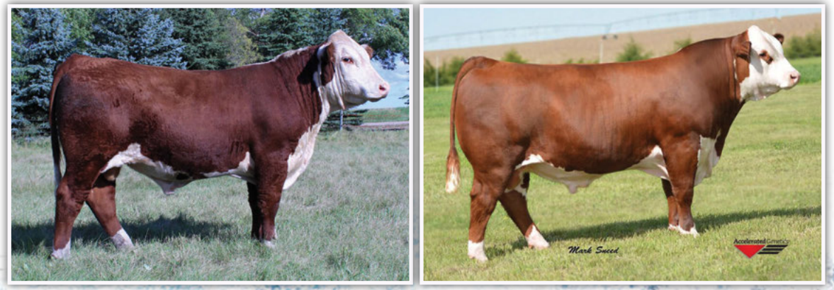
HARVIE AD HARLEN ET 199B - SIRE

AI bred to R Leader 9646 ET on April 29, 2017. Pasture exposed to Blair's 208Z Titlest ET 13C from May 2 to July 16, 2017.