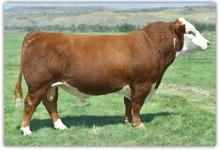
CHURCHILL RED BULL 200Z - SIRE OF 9A